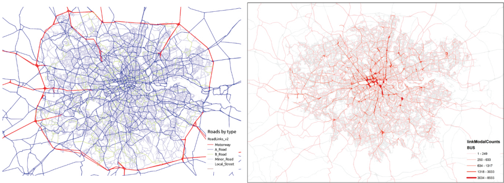
Figure 73.1: Snapshot of the road network for London's case study colored by road type (left) and map showing number of bus trips per road segment in London using timetable data (right).

More detailed information on the building of the model including some results from each module previously described can be found at: http://eunomia-project.eu/publications/ (Report on Case Study 1: London).