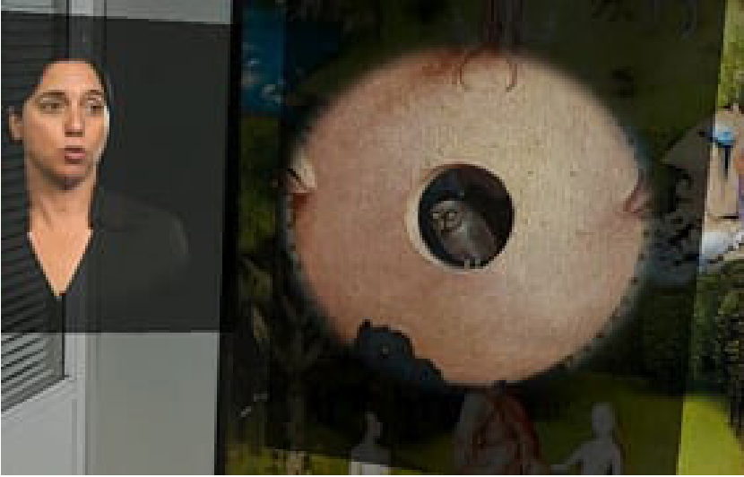
Figure 1: Example of Garden storytelling.

maintenance of a collection of virtual contents in real space, and its location in one or several rooms – and, on the other hand, those generated by the absence of a consensus language for the management of AR contents with holographic glasses.