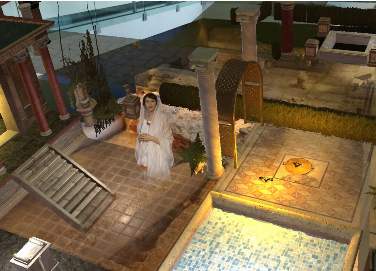
Figure 4: Preview of the virtual architecture and character in the Almoína.

During the narration, and as a part of the ‘magic’ strategy, a digital pool appeared, filled with water, and two figures emerged at the side, depicting medical treatment. Because all these virtual representations are perceived over the real place, the comprehension and value of the ruins change completely in the