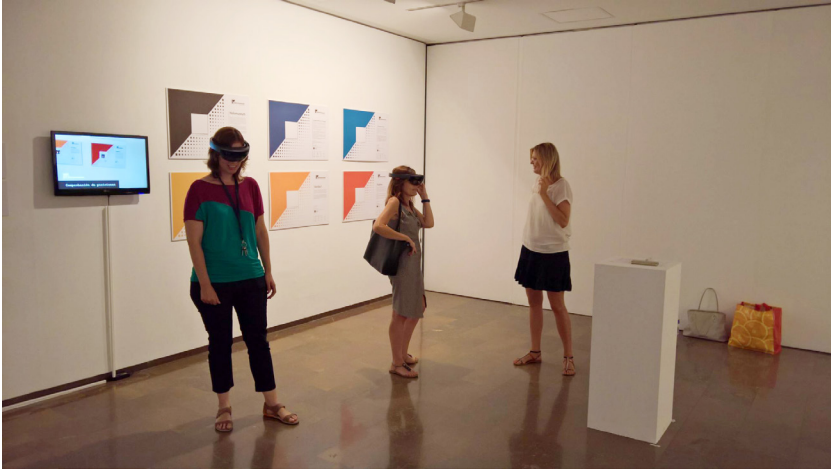
Figure 3: Example of Holomuseum exhibition.

To expose these contents, some panels were printed to serve as physical posters or labels for each element. These panels explained each object. The holographic cubes were physically placed on these posters, which, once activated, were loaded from the internet and flew to the different areas of the room previously selected by the curator. At the centre of the room, a pedestal was placed to serve as a physical support to place digital contents.