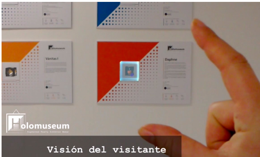
Figure 2: Example curator view for editing, and visitor view for visualising.

identify, and remained on the wall, opened until the visitor decided to close it with the voice command 'close box', or just by air-tapping the box again with their fingers.