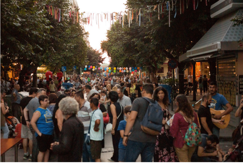
Figure 6: The 3 rd Spring Dinner in 2016.

phere in a stagnant and crumbling reality. In this sense, although the dinner constitutes a heterotopic performance that creates a short-term community, its focus is on the 'next day' and the potential changes in social attitudes and perceptions. The concern here is how far the Spring Dinner has managed to provide the foundations for more diverse networks (extrovert or introvert) that might add to an evolving but gradual process of neighbourhood-building, connecting people to their locality over a period of time far beyond the confines of the event itself.