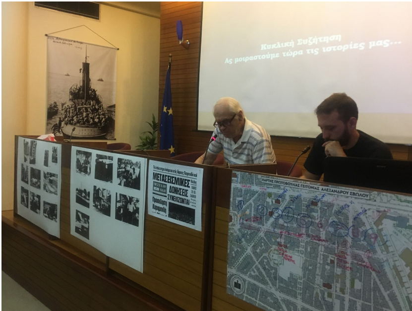
Figure 11: 30 years from the Earthquake of 1978: A Night of Memory in the History Centre of Thessaloniki.

visualisation and aestheticisation, making it possible to reclaim the neighbourhood as a “collective work of art” (Lefebvre 1996: 174).