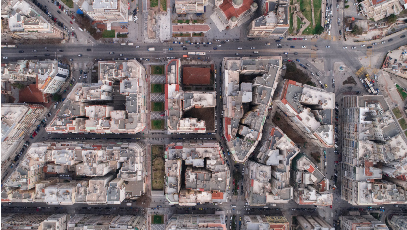
Figure 7: The urban 'void' from above (in the centre) (Source Vaggelis Ameranis, The White Dot).

What is particularly significant about this urban 'void' (431,65 m 2 ) is its ownership regime. It consisted of a vacant piece of public land that had been left to become derelict. 70% (337,05 m 2 ) of its total area belongs to the School Buildings Organisation SA, a state-owned public limited company based in Athens, with the other 30% (94,60 m 2 ) belonging to the Municipality of Thessaloniki. A reasonable question that arises from this situation is why an urban 'void' should belong to two public institutions? Why would the Municipality of Thessaloniki purchase a piece of wasteland from another public institution, especially when this space does not have any other apparent use other than land-fill? Comparative research on other cities revealed the remarkable fact that, for example, in Helsinki (Finland) all the public land belongs to the city itself, whilst the revenue from public services (see Helen Electricity Network Ltd) is mostly reinvested back into the urban fabric. In contrast, Greek cities seem to be unwilling or incapable of managing their urban fabric. Therefore, the creation of this space is highly relevant in relation to urban planning and the production of alternative spaces, while also holding the potential to encourage more inclusive and democratic forms of planning.