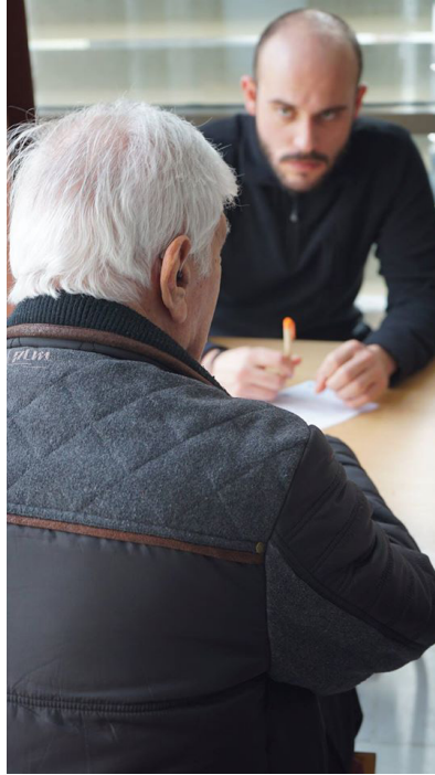
Figure 10: A two days seminar on oral history in the Municipal Central Library.

to a place or in time ... It provides a means for a radical transformation of the social meaning of history” (Thompson 1978: 18).