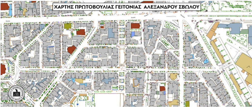
Figure 3: Alexandrou Svolou's Neighbourhood, according to ASNI (Source: GIS Thessaloniki, edited by Periklis Chatzinakos).

to the broader city, one must take into account its proximity to the Aristotle University, the Municipal Central Library, the International Helexpo, the History Centre of Thessaloniki, the church of Hagia Sofia, the Arch of Galerius