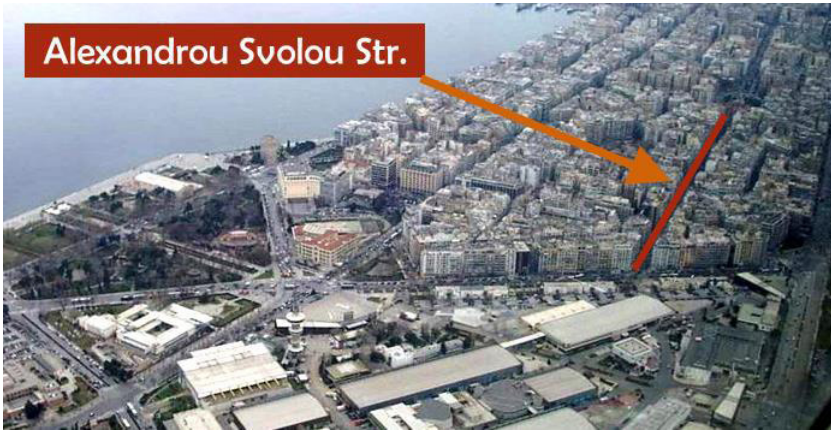
Figure 4: An aspect of the historical centre of Thessaloniki.

and Navarinou Square. 71 Apart from this square, of city-wide importance and consisting of a public space that has traditionally been shared by a mosaic of different sub-cultures and urban tribes, there is a significant lack of open and green spaces. In order to provide an in depth understanding of the geographical specificities of the particular neighbourhood, the most ideal approach would be a detailed, demographic analysis of specific administrative boundaries. However, quantitative data is not available for the sub-area under consideration. The only census data available is the total population of the 1 st Municipal District, 72 which is considered too large an area for the focus of this study. It must be noted that in Greece it is not common for researchers and/or residents to be afforded access to demographic data through open-source neighbourhood monitoring systems, as is the case in many other cities around the world (e.g. Brussels, 73 Manchester, 74 Vienna 75 etc.). For this reason, the empirical understanding of the social landscape of the neighbourhood is shaped through the qualitative elements of the research, such as interviews, observations and secondary sources.