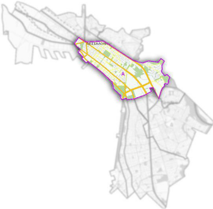
Figure 1: The administrative boundaries of the 1 st Municipal District.

The neighbourhood of Alexandrou Svolou is located within the administrative boundaries of the 1 st Municipal District, which is comprised of five sub-neighbourhoods that include the historical (landmark monuments), administrative (City Hall), cultural (museums) and commercial centre of Thessaloniki (Figure 1). However, those sub-neighbourhoods ( \Sigma 1 , \Sigma 2 , \Sigma 3 , \Sigma 4 , \Sigma 6 , M1, Figure 2), are not officially recognised as separate units by the city's administration. For this reason, ASNI demarcated an area of broader interest and named it after Alexandrou Svolou Street, a central mild-traffic axis that lies between the two major streets of the city that horizontally divide its historical centre (Figure 2 & 3). The urban fabric can be characterised as continuous, interrupted only by several vertical streets and pathways. The area is characterised by high density housing that follow the model of vertical social segregation, a typical characteristic of the Greek city (Maloutas & Karadimitriou 2001) (Figure 4). Although it is a relatively residential neighbourhood that mainly houses middle class families, the elderly and students, it is full of cultural life and spaces of consumption. Analysing the position of the neighbourhood and its relationship