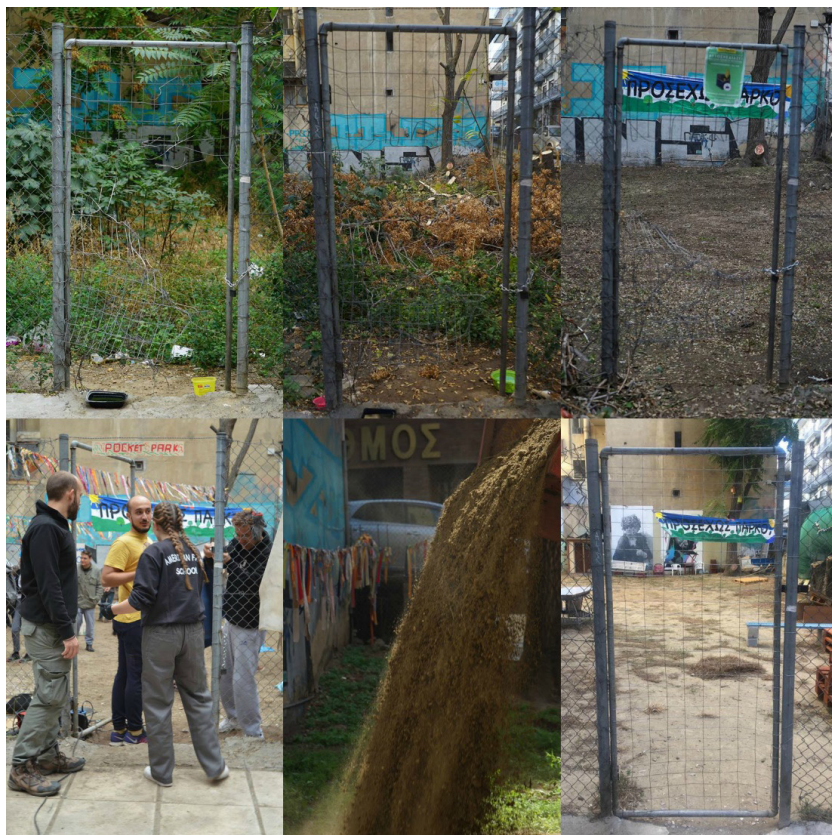
Figure 9: The gradual transformation of an urban ‘void’.

Association, 78 ASNI organised an introductory seminar that took place in the Municipal Central Library. The seminar aimed to familiarise participants with the theoretical, methodological and ethical aspects of oral history. Oral history is closely linked to local cultural heritage, since it is