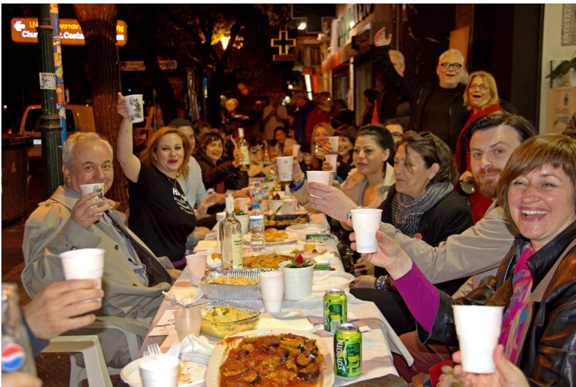
Figure 5: The 1 st Spring Dinner in 2014.

public space. With the passage of time, ASNI established a flexible event management plan by experimenting with different research approaches and methodologies, mixing various ‘good practices’, and effectively integrating the local creative capital and its socio-cultural attributes. Subsequently five consecutive Spring Dinners, variations on the above model, have taken place on an annual basis. Since 2016 each dinner has attracted around 5,000 people, including local musicians and artists. It would seem that this pilot urban experiment created a more fertile ground for carrying out further activities and, indeed, is nowadays considered to be a benchmark in the city. 76