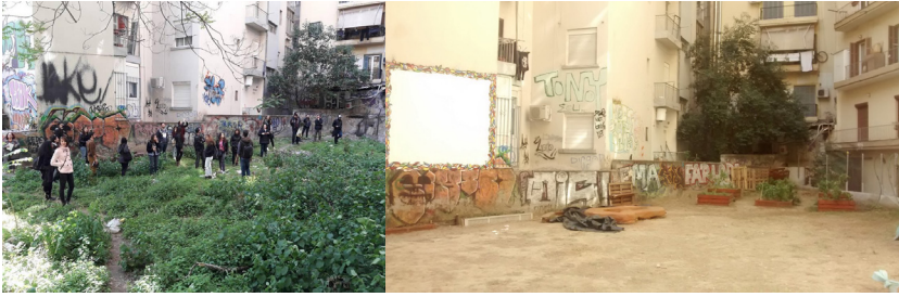
Figure 8: (left): How the space looked at the time of the participatory planning workshop in 22.04.2017, (right): How the Park looks now, about a year and a half later.

information points in various spots in the locality and collaborating with the local primary school. Passing from participatory planning to participatory action, the Initiative has so far organised 9 consecutive ‘construction acts’ (cleaning, embankment fill, urban garden, plantings, cob workshop, self-made urban infrastructure/benches, gym, entrance, feeders for stray animals) and a variety of cultural events (fundraising concerts, a summer cinema, collective dinners, workshops, artistic performances etc.) demonstrating a particular appetite for community engagement along the way. Despite profound bureaucratic limitations, 77 ASNI is still developing this project, without any external sources of funding. The methodology that was used is considered ground-breaking for the city, as there have been no other cases effective bottom-up participation in urban planning.